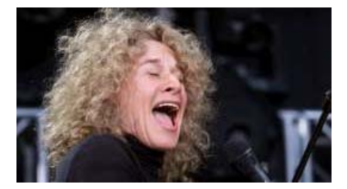
Carole King's musical legacy fully realized in 'Beautiful'