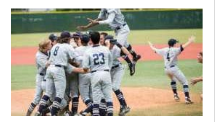
State title culminates reunion for Second Baptist coaches