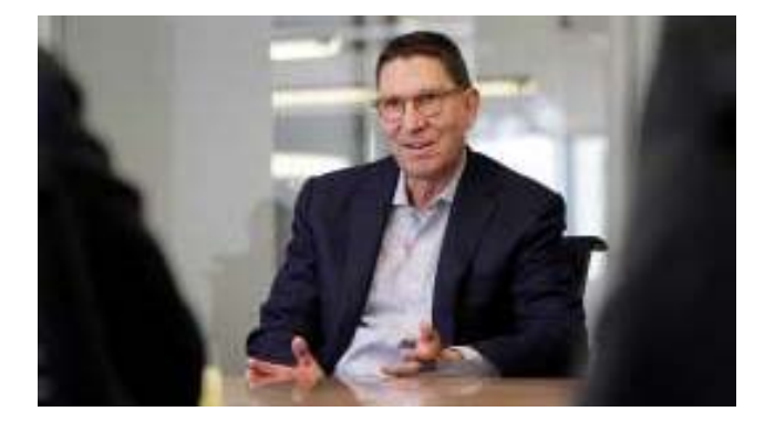
H-E-B backing effort to make dry area of Heights a little more