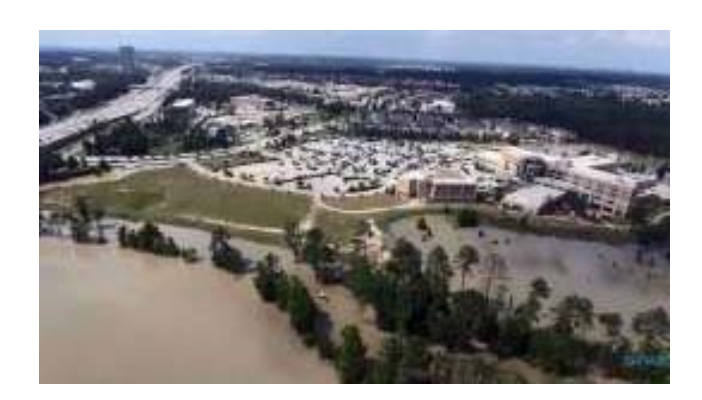
Group sues, saying city not doing enough to prevent flooding